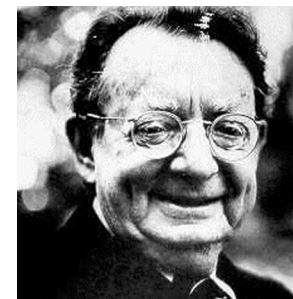
I. F. “Izzy” Stone

The award is named after I. F. “Izzy” Stone, the legendary muckraker who for decades exposed government deceit and assaults on civil rights and liberties, notably through I. F. Stone’s Weekly (1953-71).